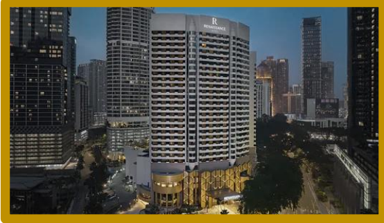
Renaissance Kuala Lumpur Hotel & Convention Centre (please choose exact property)

Choose either one of these properties and make your reservation