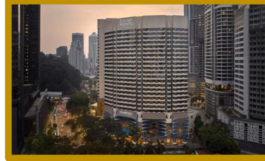
Four Points by Sheraton Kuala Lumpur, City Centre (please choose exact property)

To Enjoy member rates for your stay at either of these hotels, visit the Please visit Marriott Bonvoy Reservation Link and enroll as a Marriott Bonvoy member to proceed with your reservations.