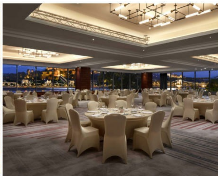
INDUCTION CEREMONY AT BUDAPEST MARRIOTT HOTEL – LIZ BALLROOM

Törley sparkling wine is offered before and after the ceremony.